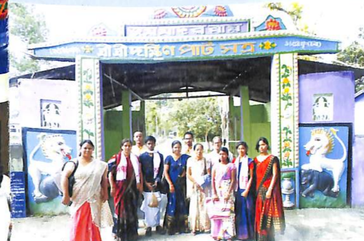
Project tour to Majuli, Dept. Geography