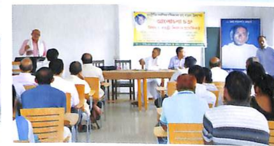
Seminer on History