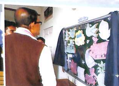
Inauguration Wall Magazine, Dept. Economics

In 2009 an Arya Bhatta science centre was established in the college campus in association with Dristi Foundation under Ministry of Science and Technology to popularize science and to develop scientific attitude amongst students.