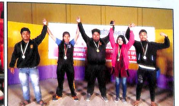
Receiving Medals in Inter-College Power Lifting, Weigh Lifting and Best Physique Tournament, 2018-19, GU