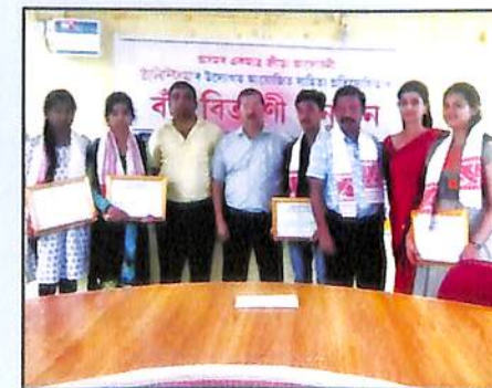
Receiving prizes in All Assam Sports Literary Competition