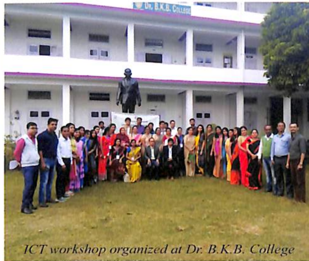
ICT workshop organized at Dr. B.K.B. College