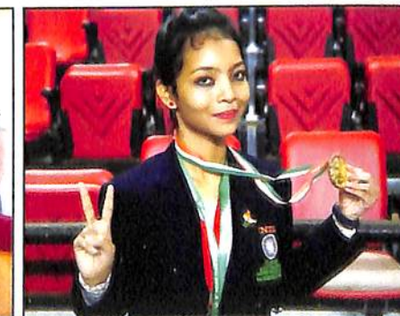
Receiving Gold Medal in the 8 th Asian Yoga Sports Championship 2018