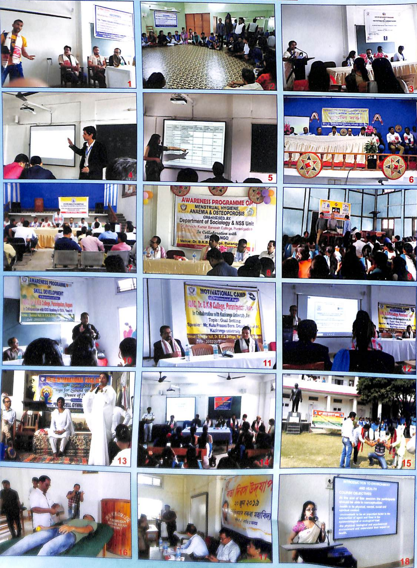
PHOTO GALLERY 2018-19