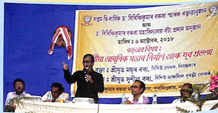
Dr. B.K.B. Memorial Lecture

Fresher's Social on August 29 and 30, 2018; Election to Students Union on September 29, 2018; College Week on February 1-7, 2019 and Parent-Teacher Meet on April 9, 2019; Feedback from Students, Alumni and Parents are taken in April, 2019.