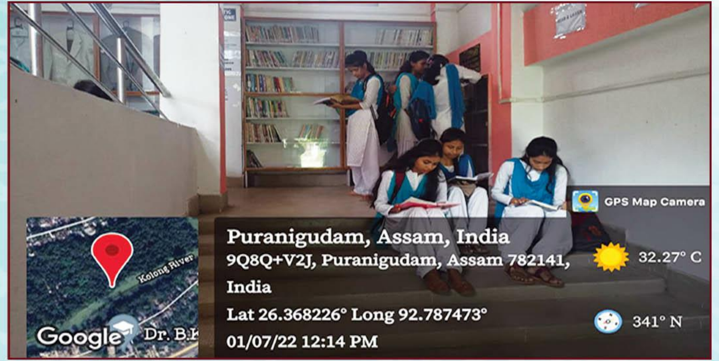
Open Library of Dr. B.K.B. College (newly introduced)