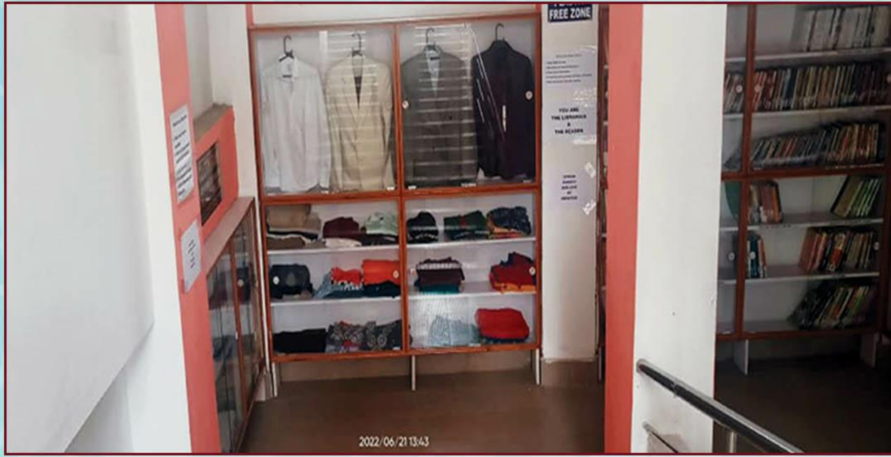
Open Cloth Bank of Dr. B.K.B. College (newly introduced)