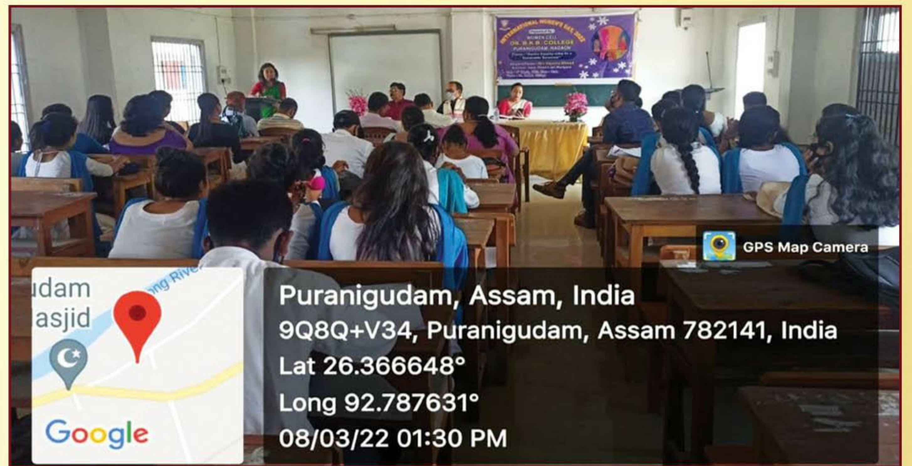
Lecture Programme on "Gender Equality today for a Sustainable Tomorrow" on the occasion of International Women's Day, 2022