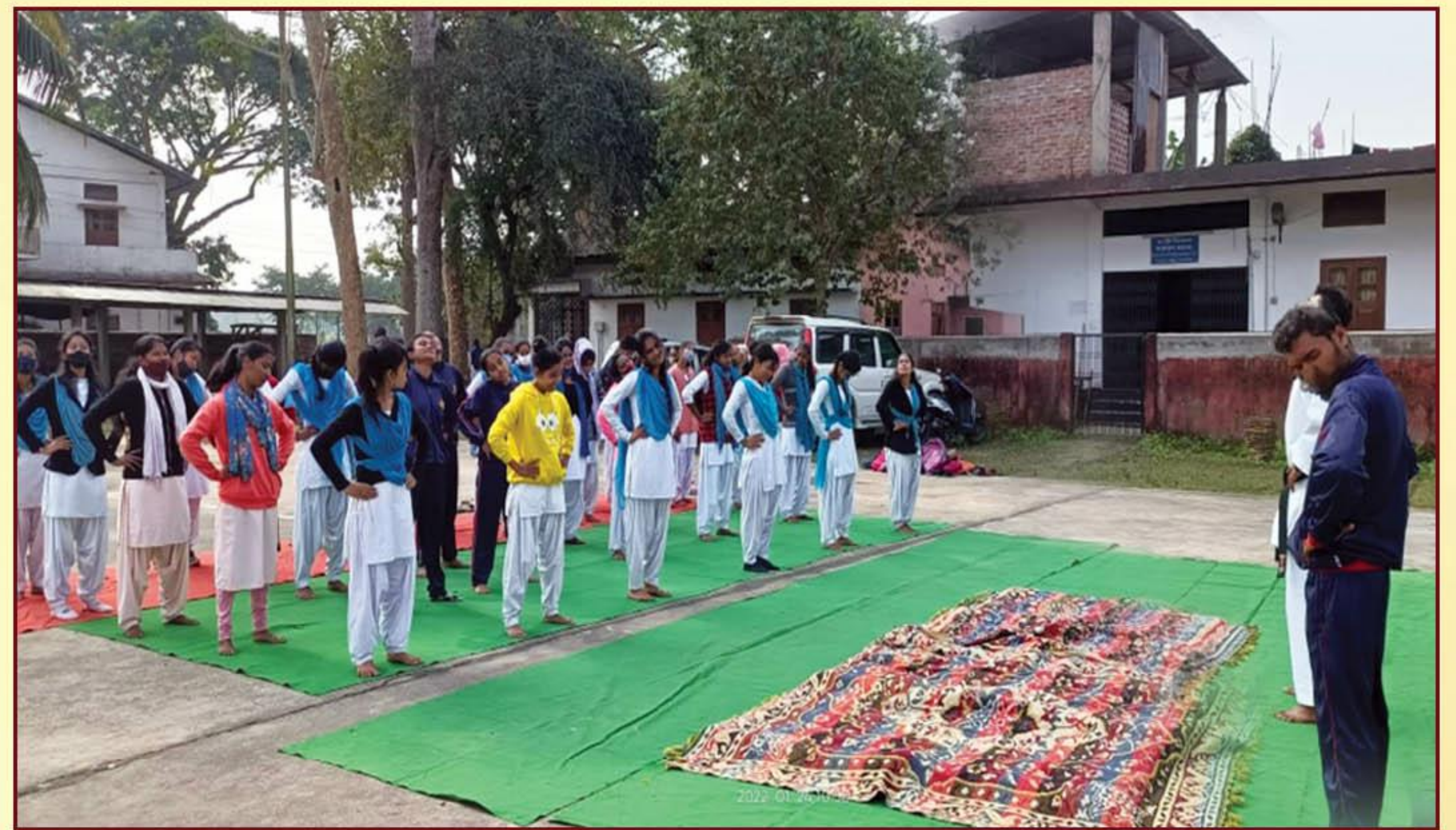
Self-Defense Training Programme