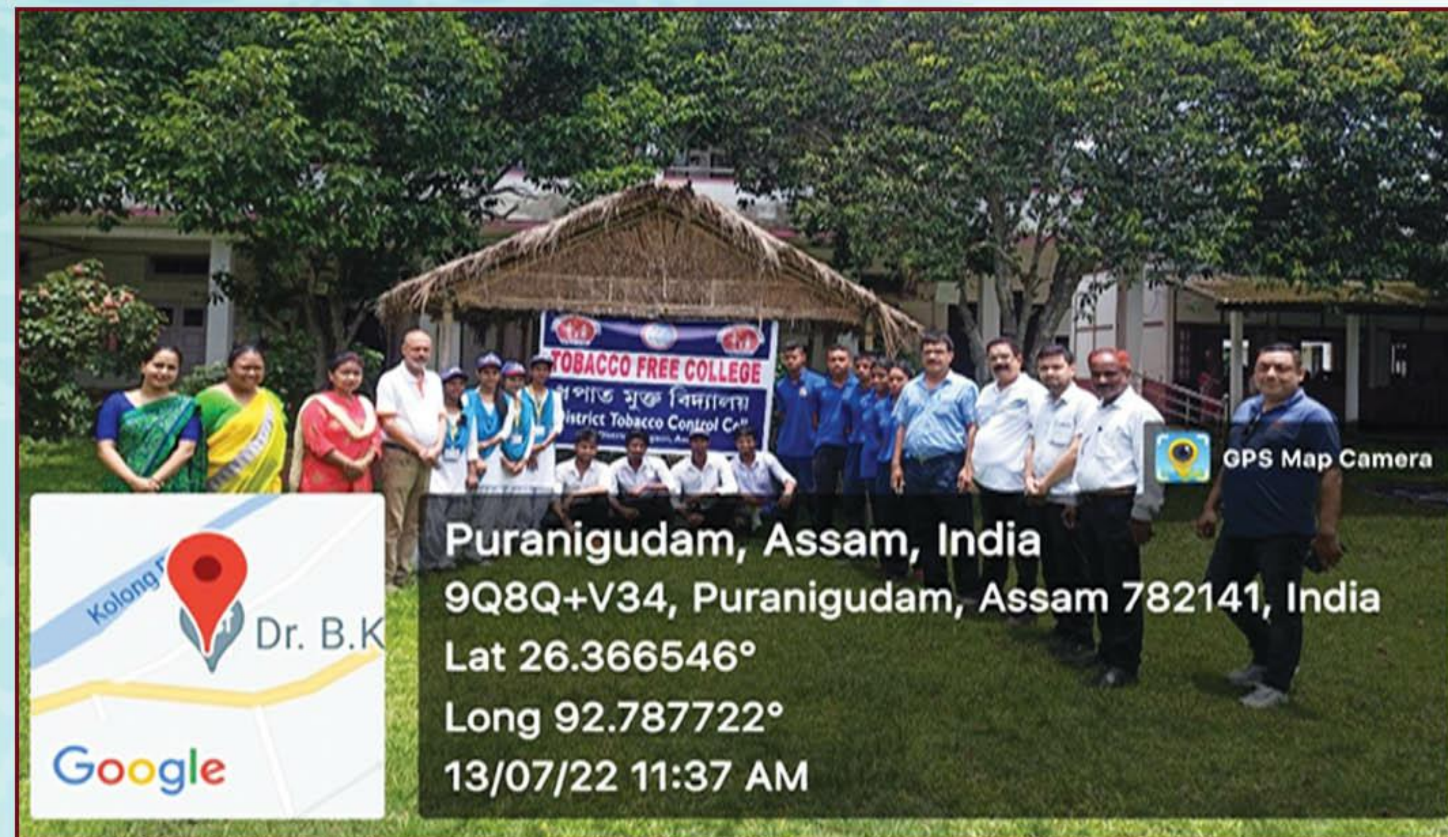
Declaration of Tobacco Free Campus