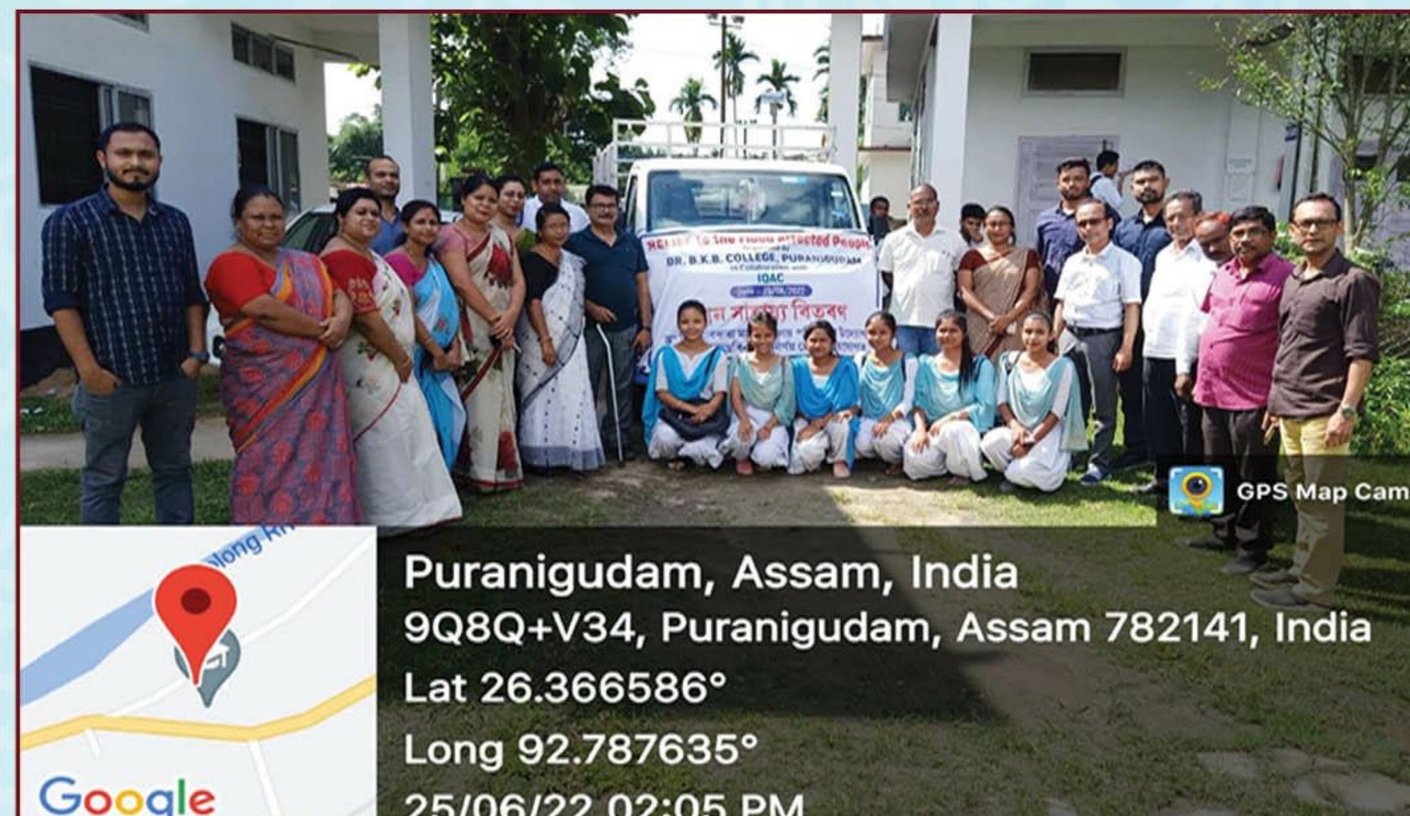
Flood Relief for the Flood Affected People of Kampur Area of Nagaon District