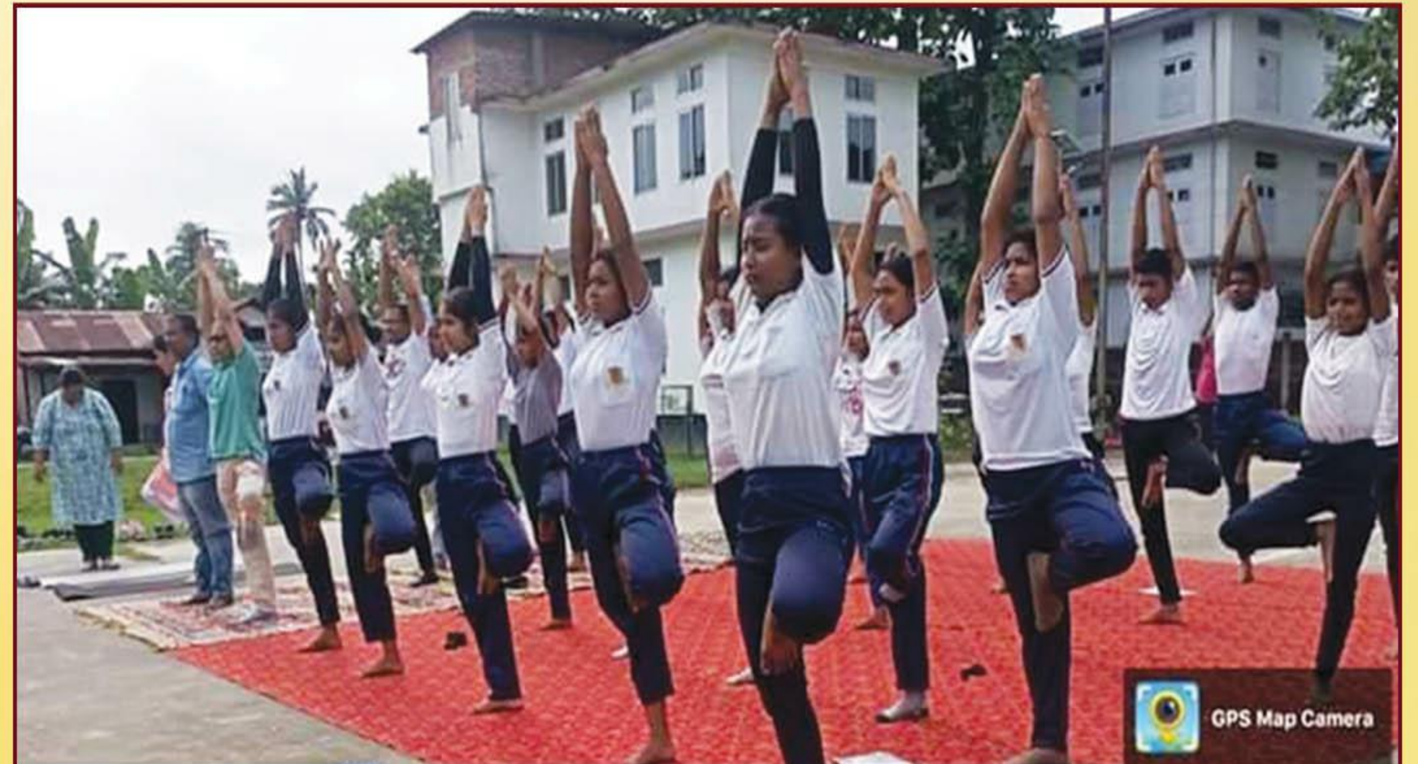
Training Programme on Yoga