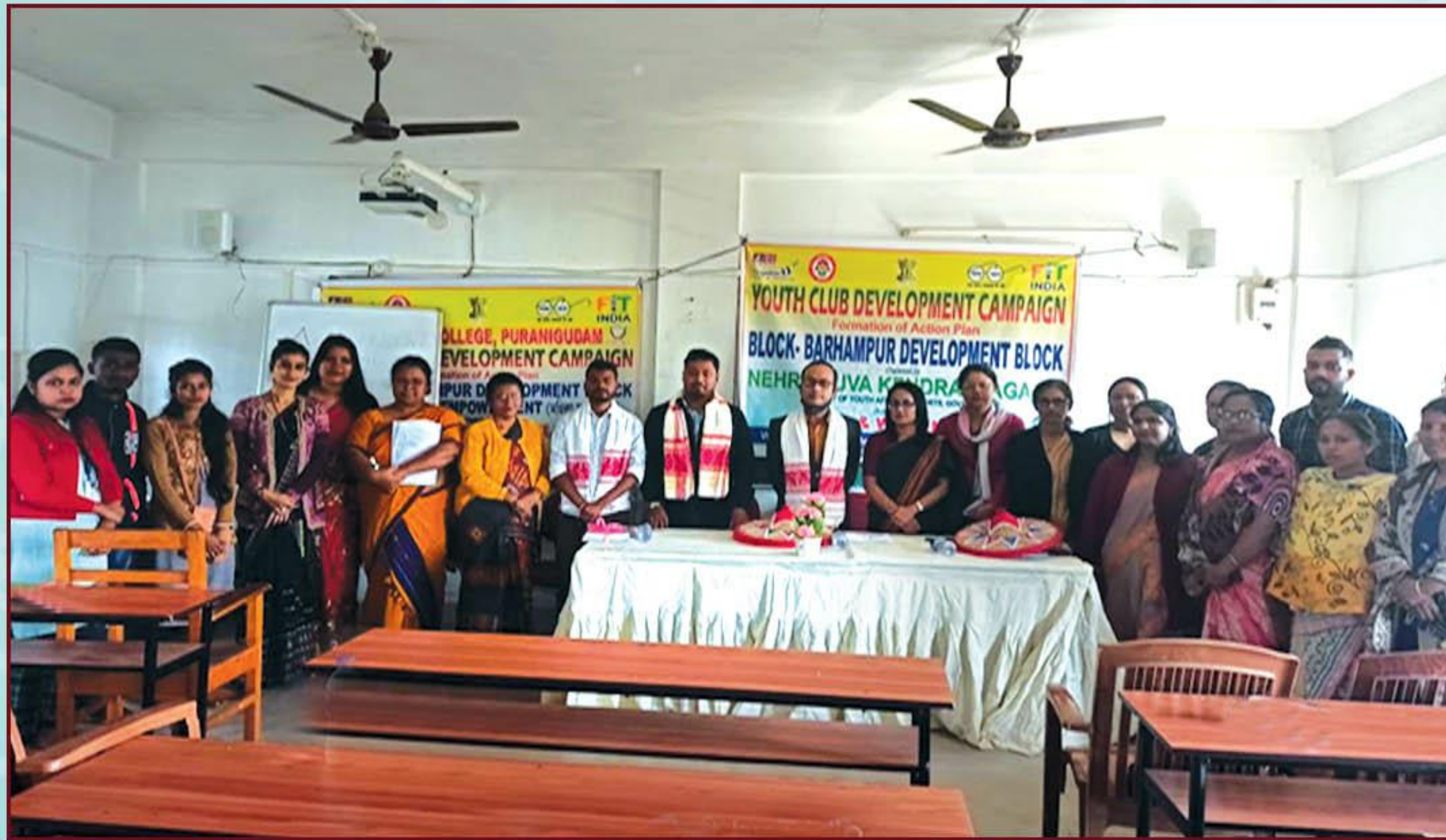
Youth Club Development Campaigning Programme on "Women Empowerment"