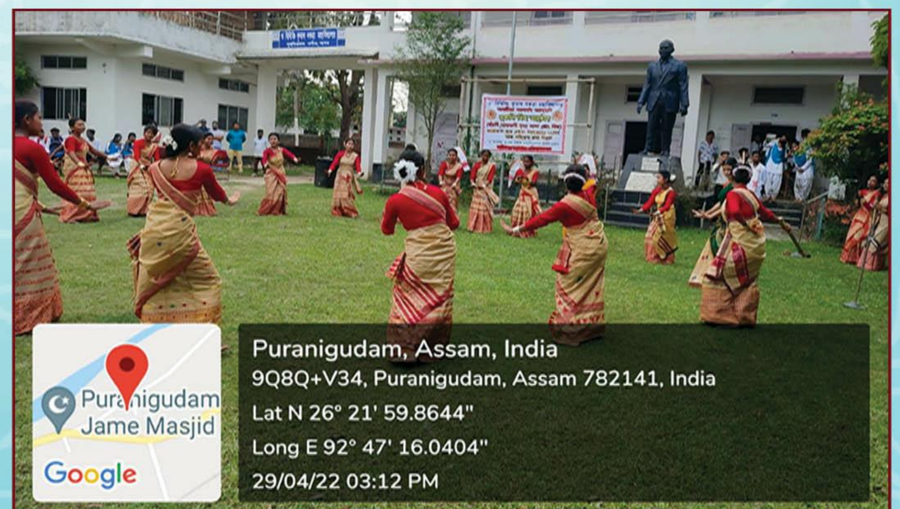
Celebration of Bihu at the Open Field