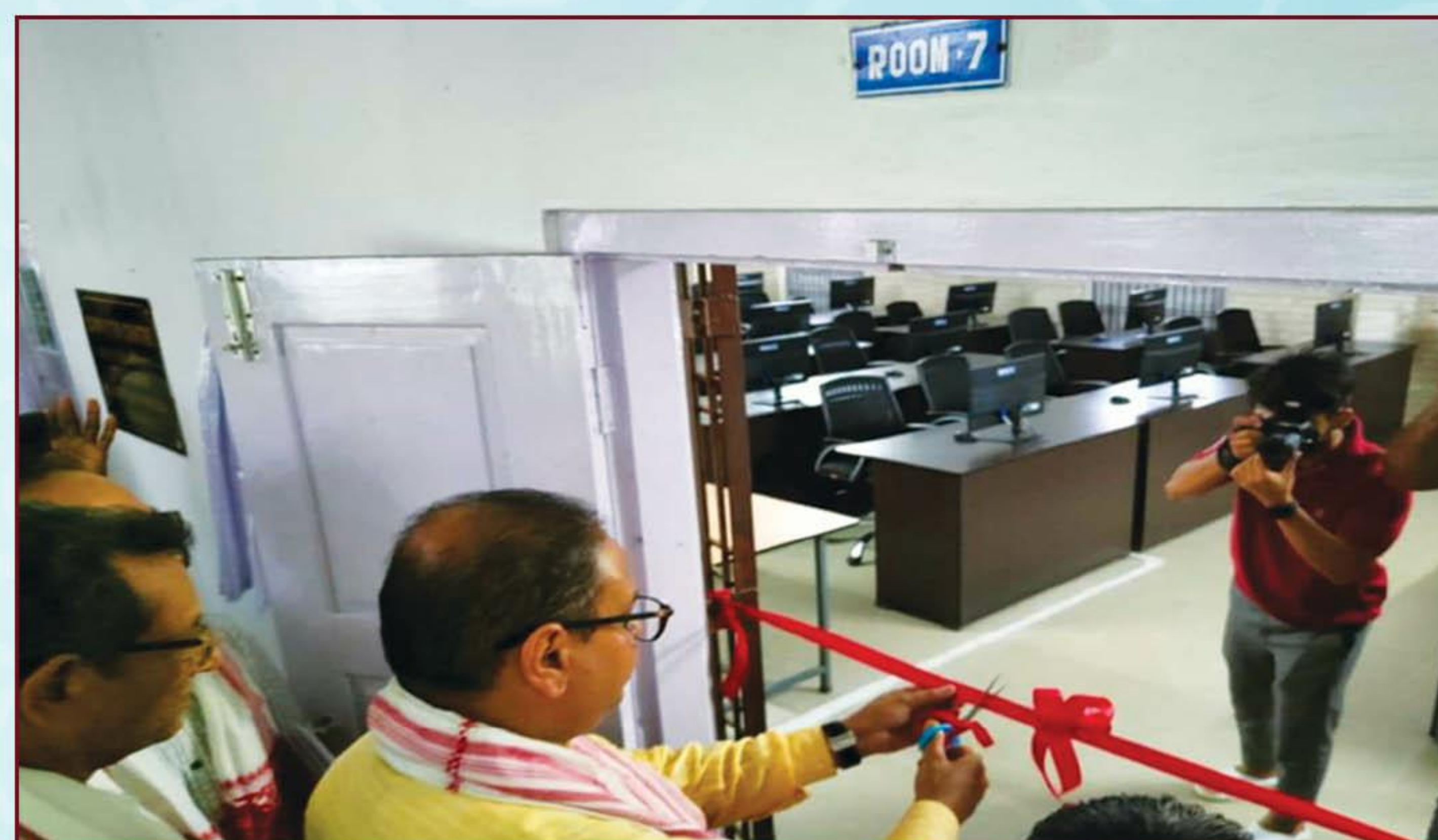
Inauguration of Computer Centre funded by RUSA 1.0 Infrastructure Grant