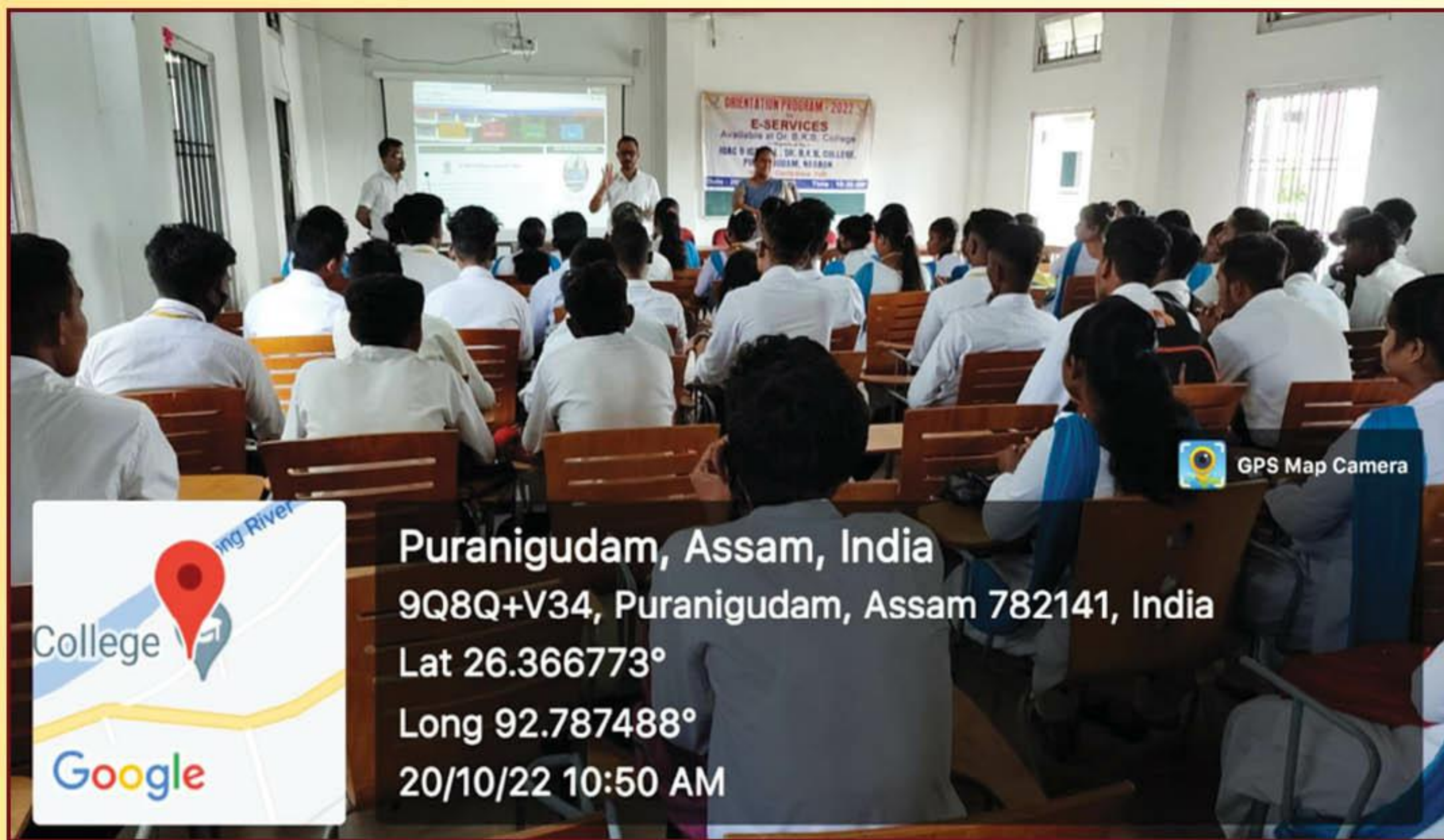
Orientation programme on "E-Facilities and E-Governance"