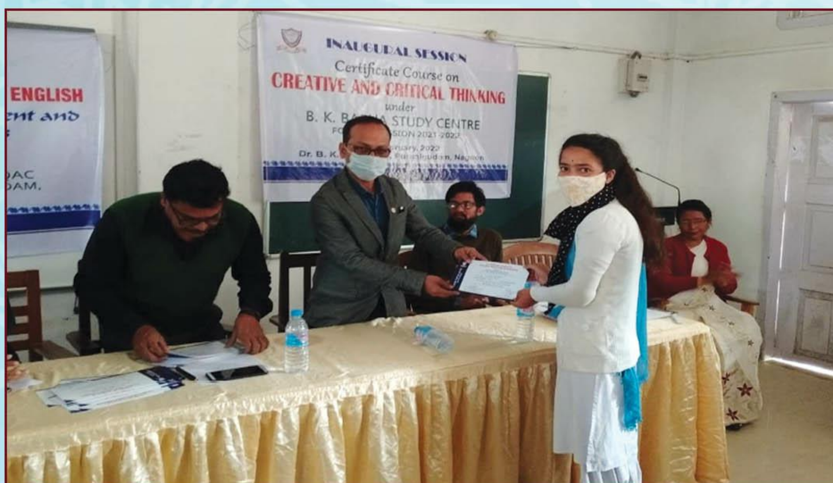
Inaugural Ceremony and Certificate Distribution Program of Certificate Courses