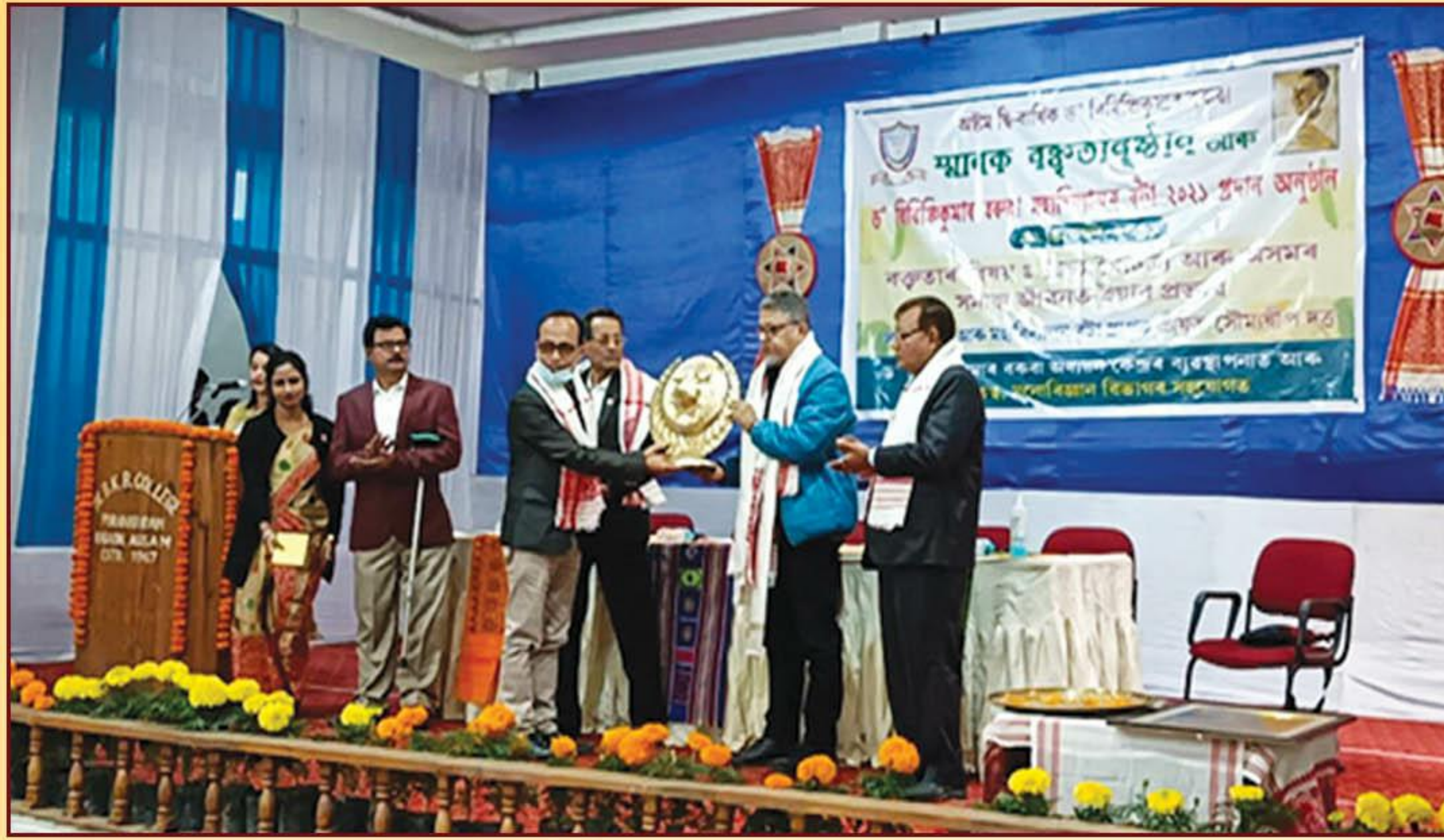
8 th Biennial Dr. B.K.B. Memorial Lecture and Dr. B.K.B. College Award, 2021