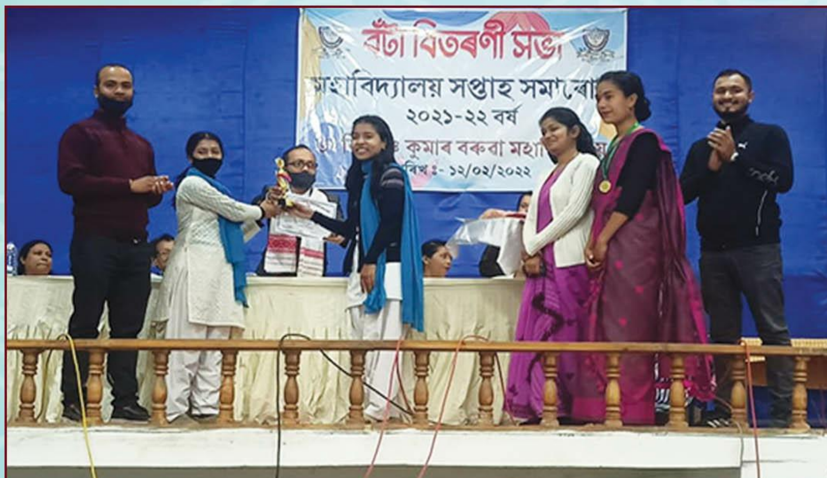
Prize Distribution Programme, Annual College Week