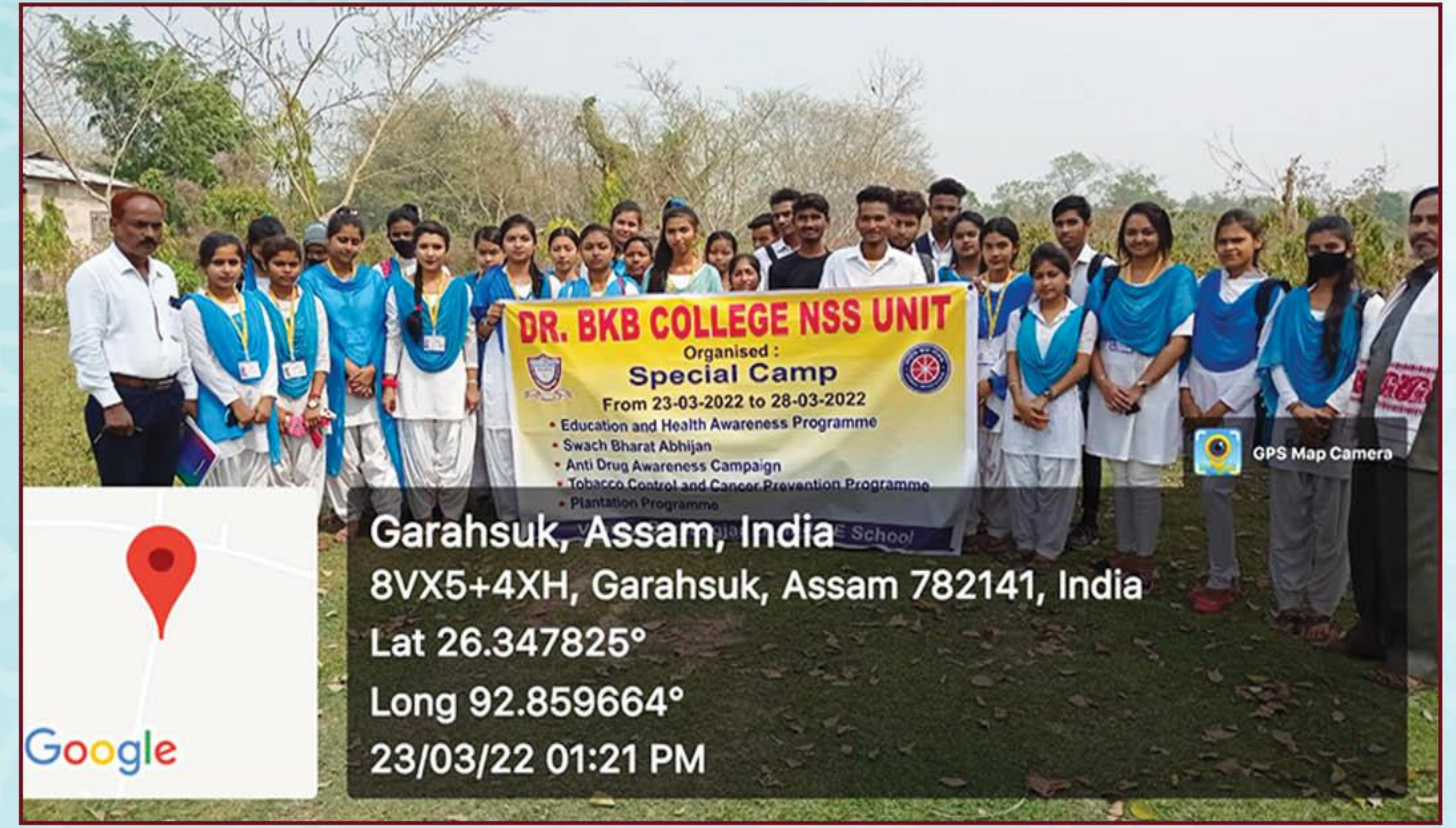
NSS Unit Special Camp