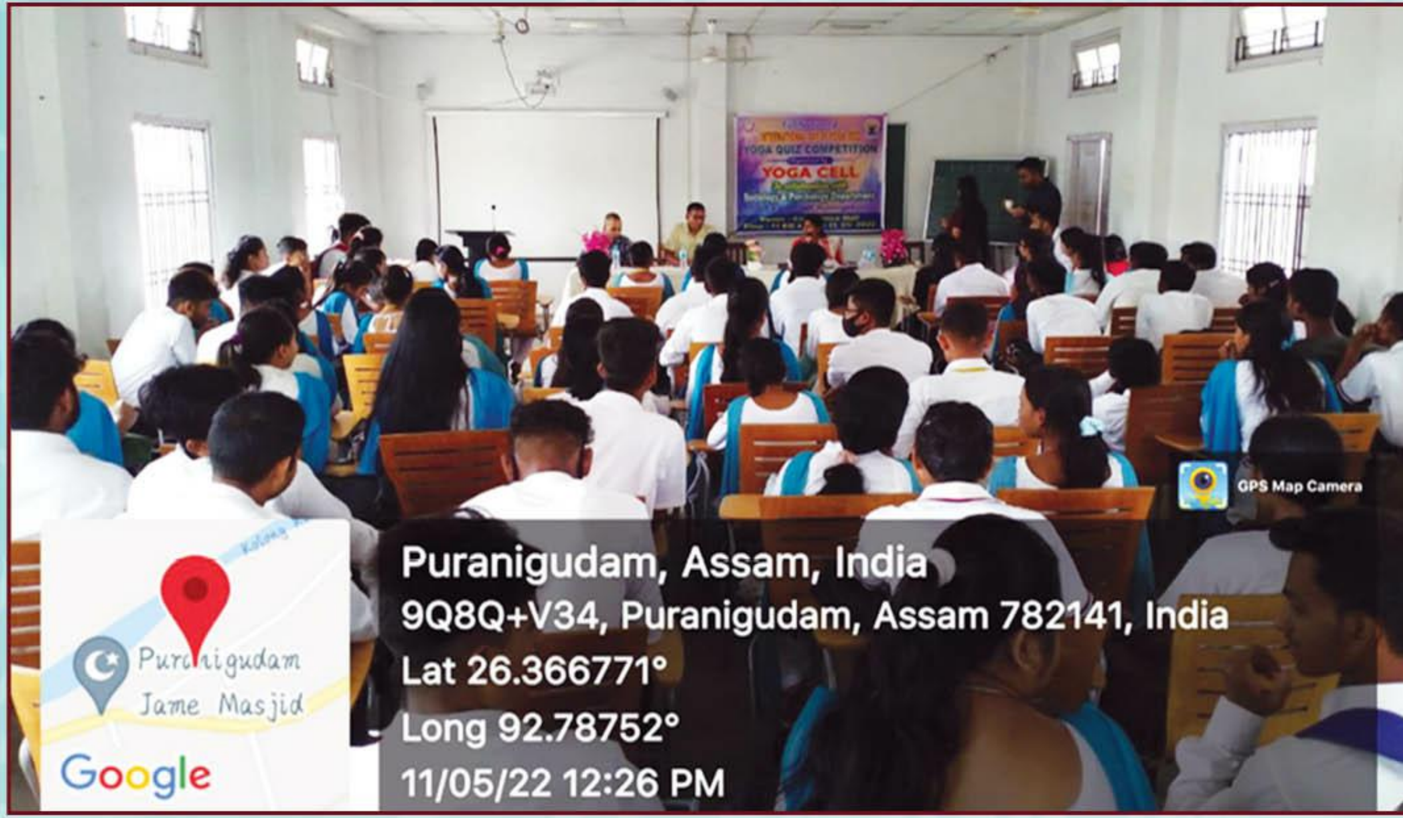
Quiz Competition on Yoga