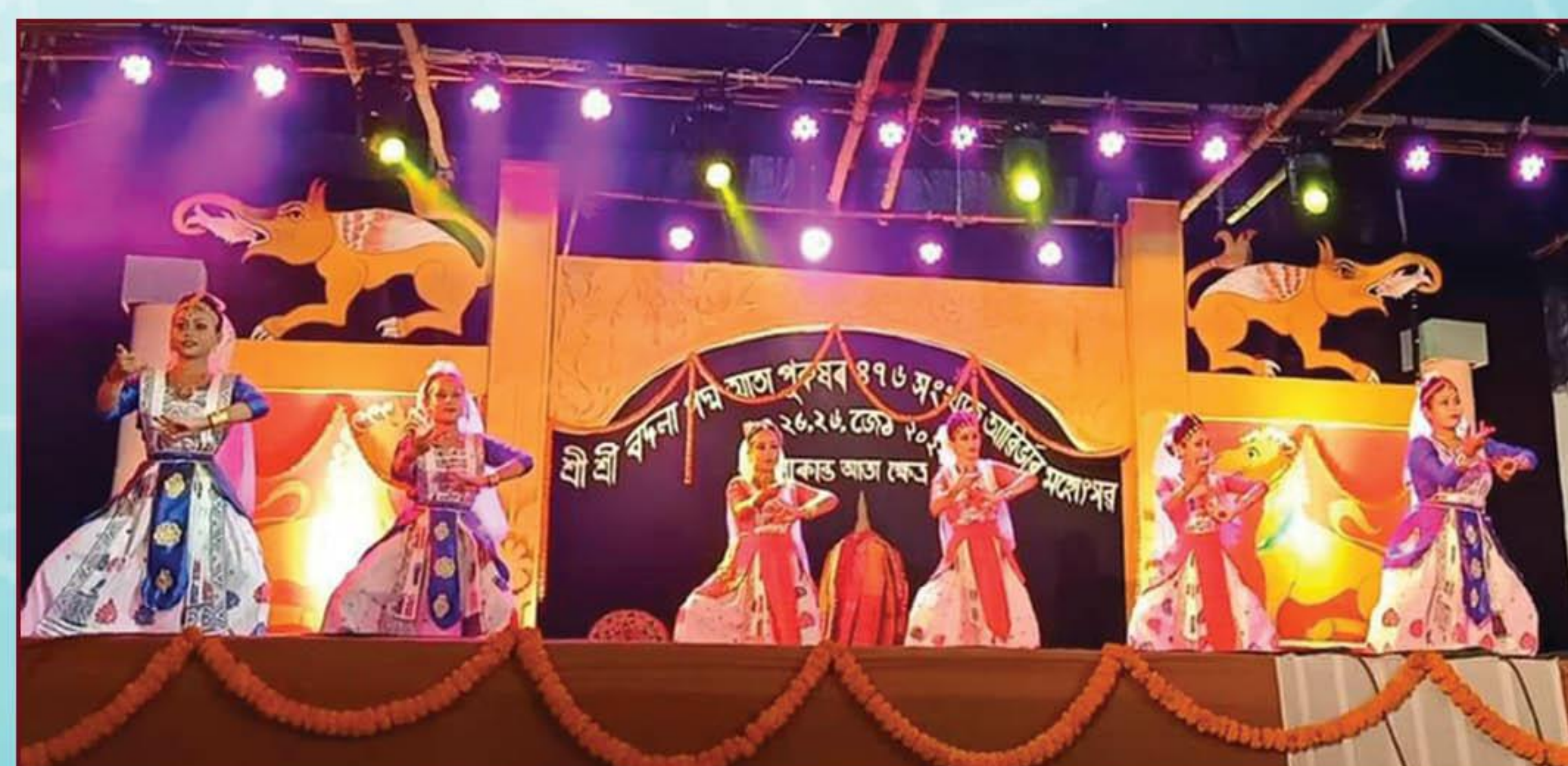
Performance of Group Dance by the Department of Satriya Dance on the Occasion of Celebration of Sri Sri Badula Padma Ata Purukhor 476th birth anniversary at Majui