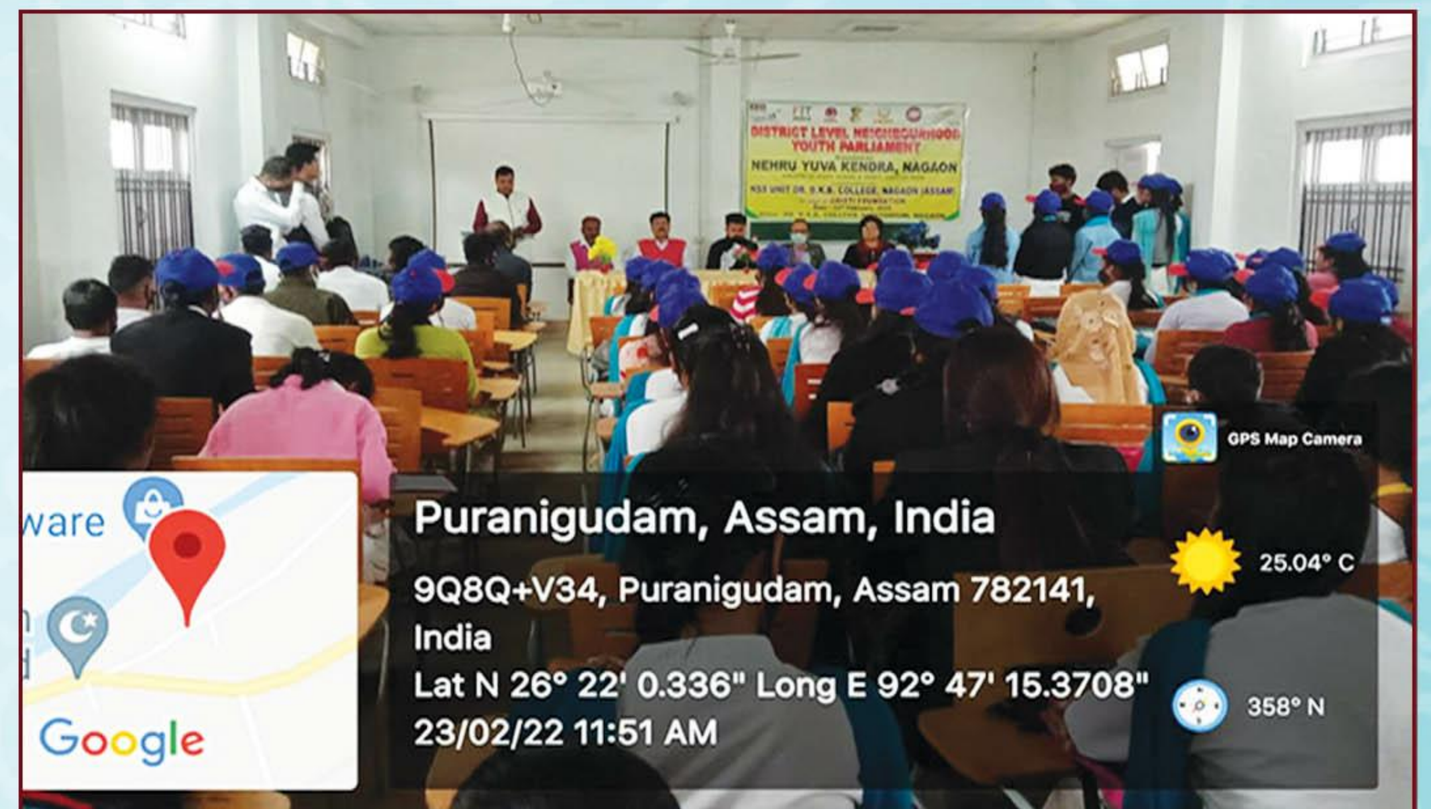
District Level Neighbourhood Youth Parliament