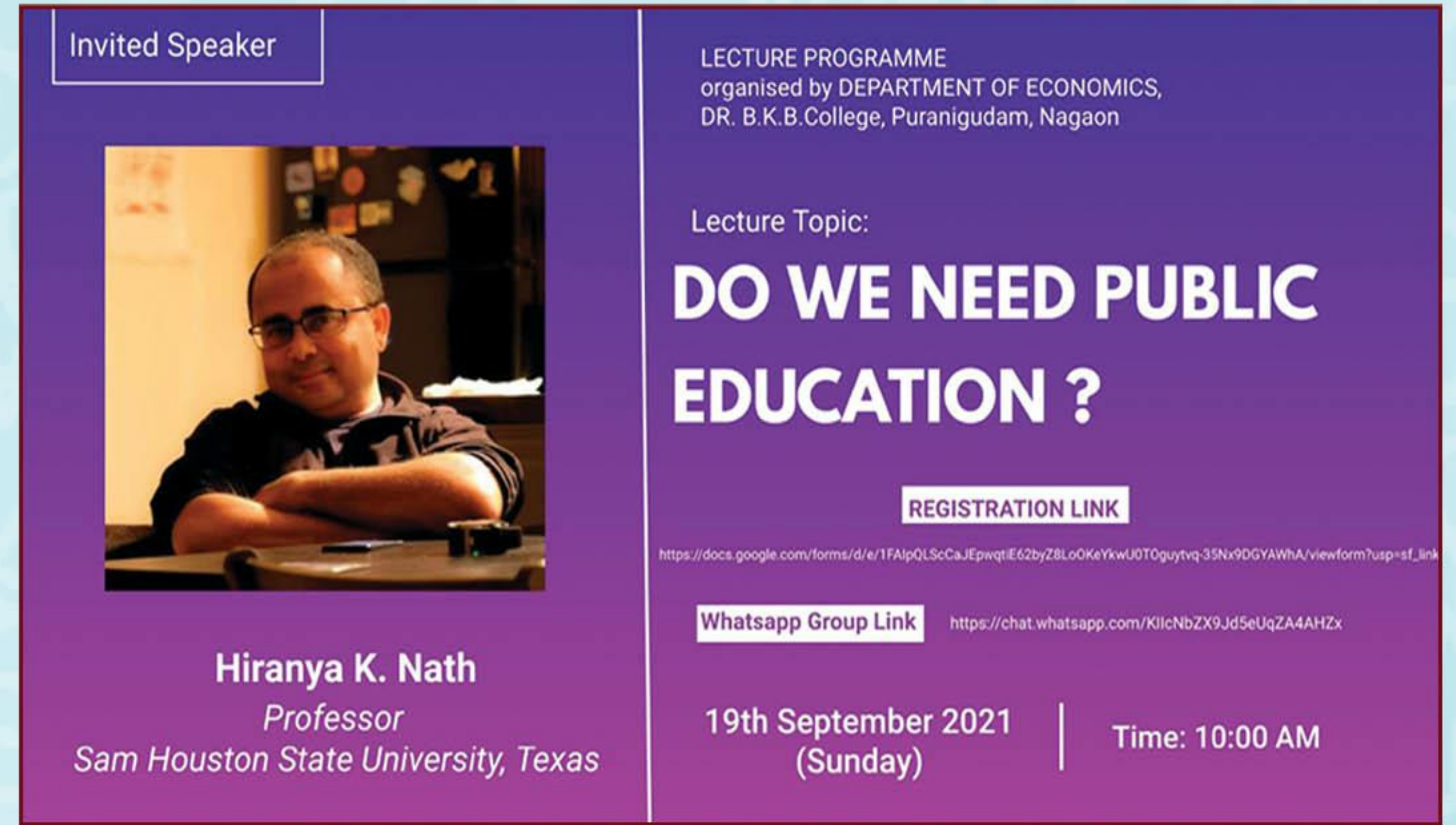
Leaflet of Online Lecture Programme on "Do We Need Public Education?"