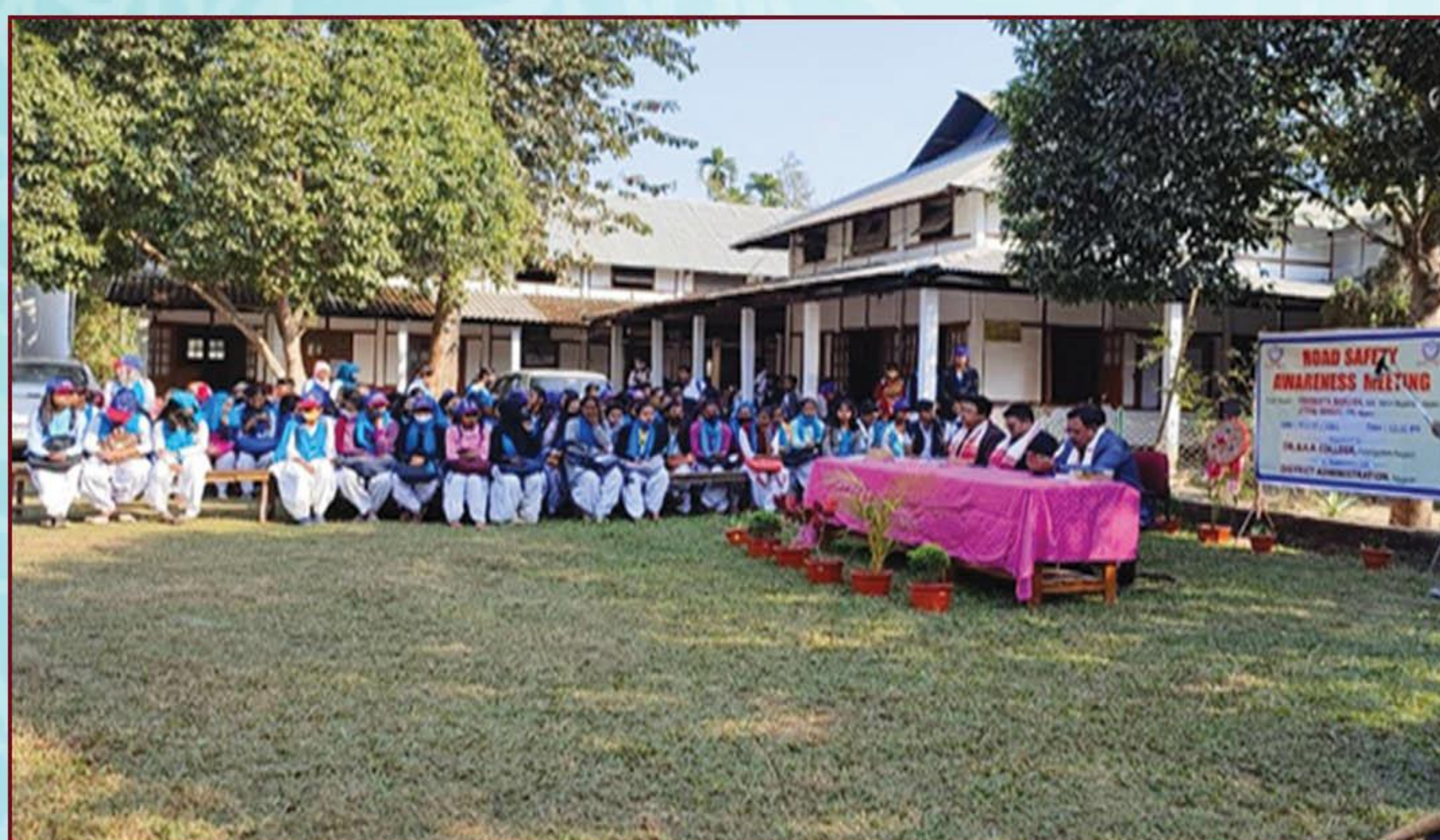
Awareness Programme on Road Safety