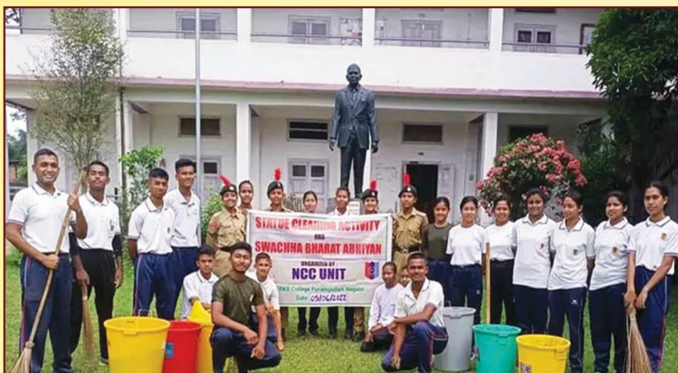
Swachha Bharat Abhiyan on 5th June, 2022