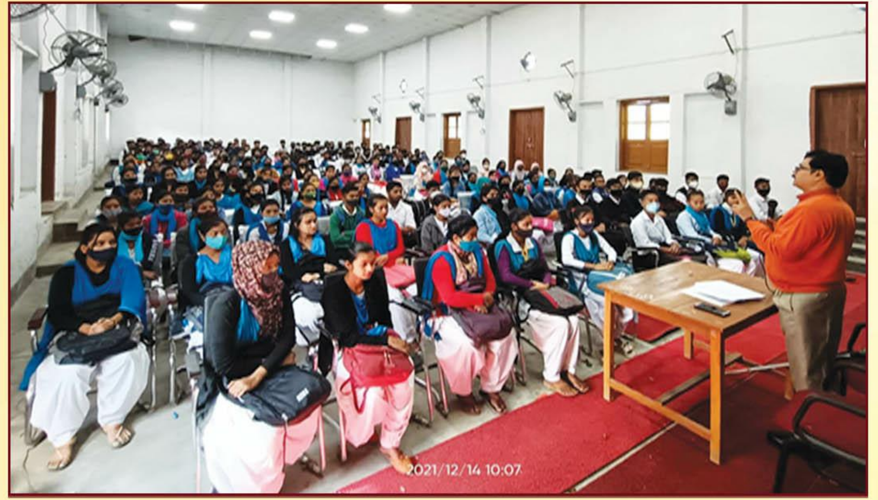
VP's Interactive Session with the newly Admitted Students of Dr. B.K.B. College