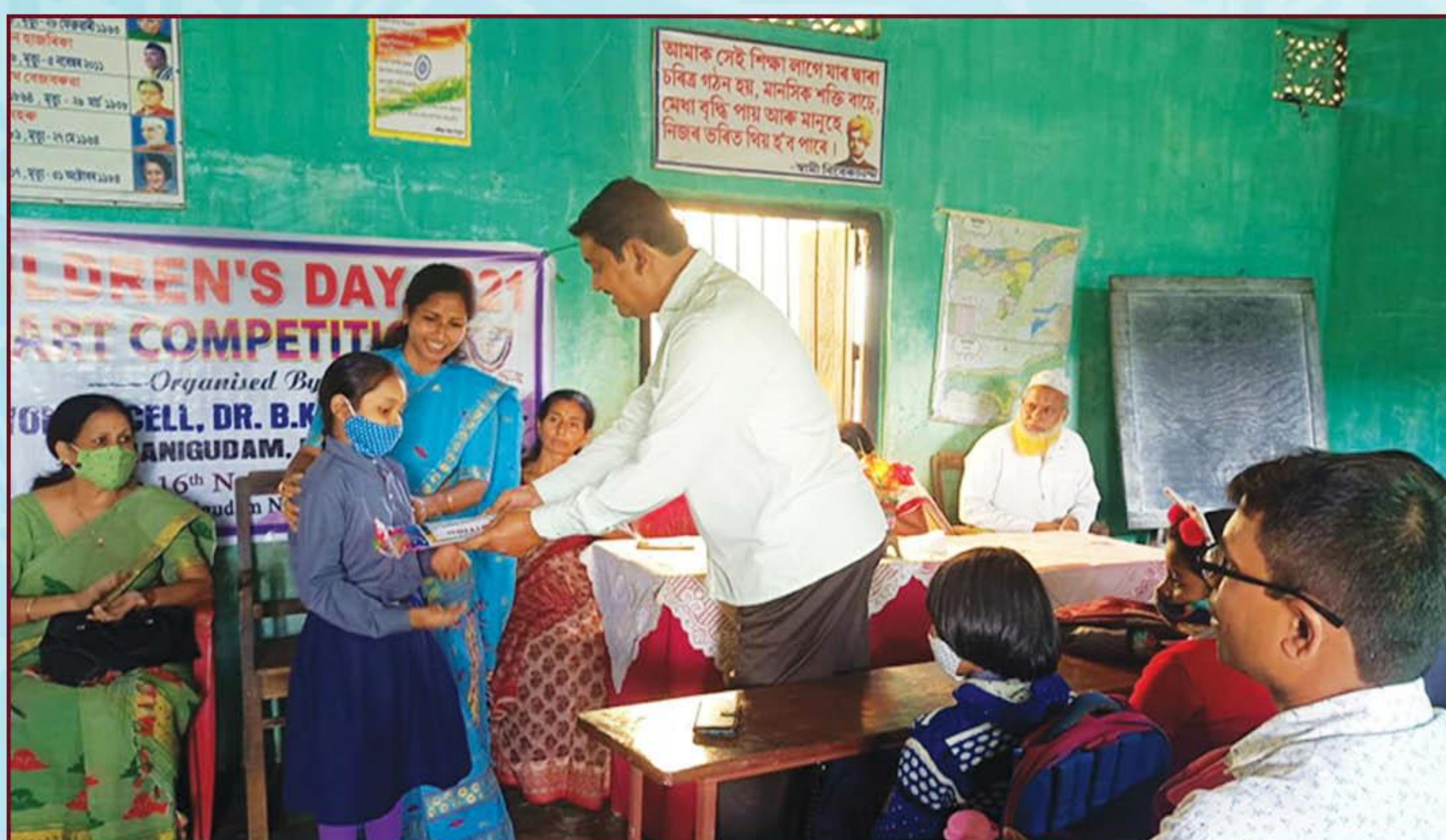
Celebration of Children's Day, 2021