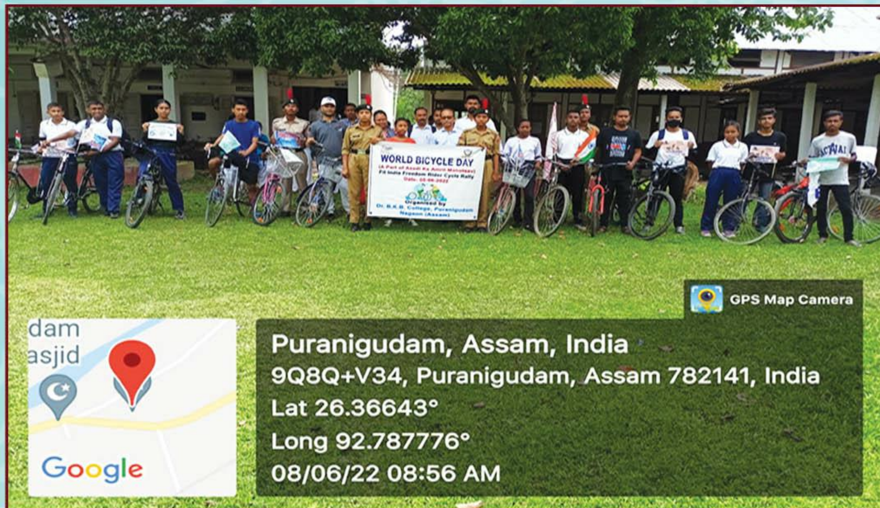
Bicycle Rally on the Occasion of World Bicycle Day