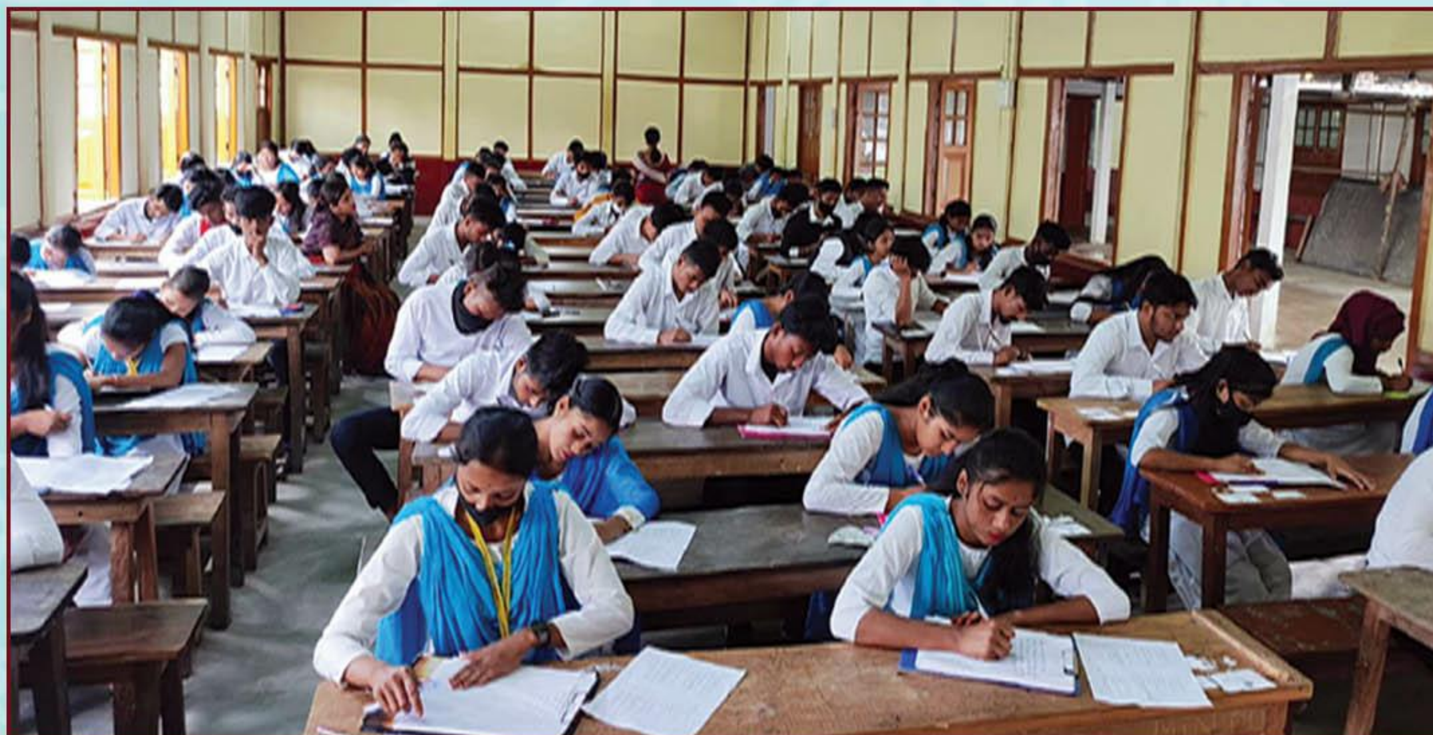
Photo of Final Examination