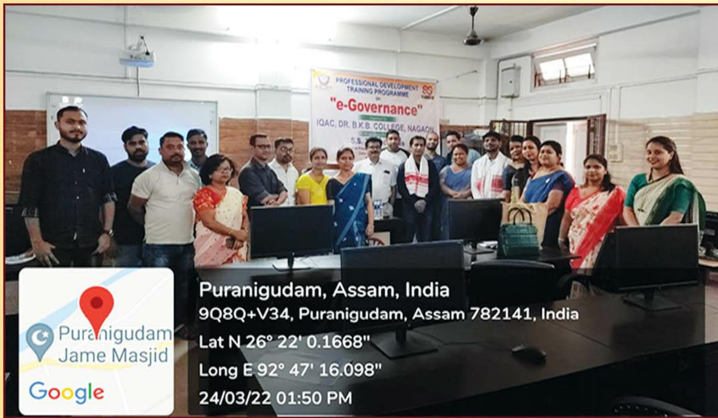
Training Programme on "e-Governance"