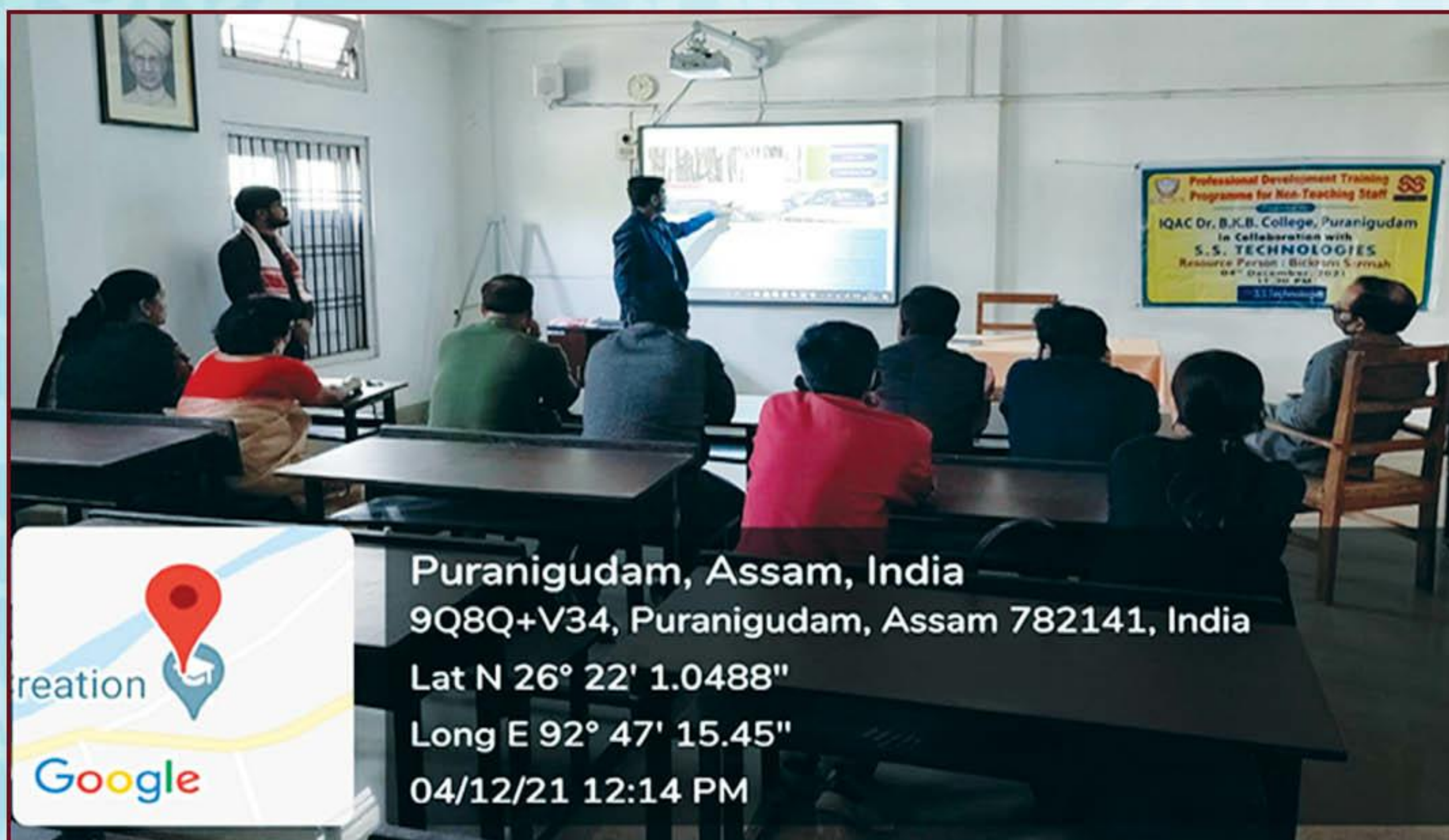
Training Programme for Teaching and Non-Teaching Staff of Dr. B.K.B. College