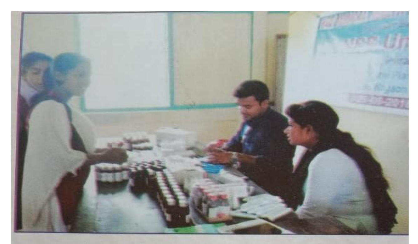
লিনাত অনুষ্ঠিত কৰা বিনামূলীয়া সিকিৎসাসেৱা শিবিৰৰ দৃশ্য ২০১৮