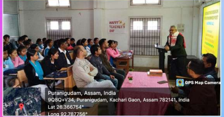
Puranigudam, Assam, India 9Q8Q+V34, Puranigudam, Kachari Gaon, Assam 782141, India Lat 26.366754° Long 92.787756°