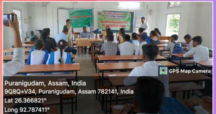
Puranigudam, Assam, India 9Q8Q+V34, Puranigudam, Assam 782141, India Lat 26.366821° Long 92.787411°