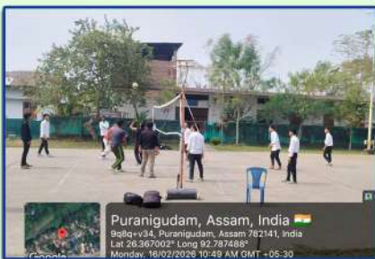
Image of College Week

All the newly admitted students are provided the college identity card. The card needs to be duly filled up and attached with a passport size photograph signed by the Principal of the college. At any time while being present in the college the principal or a teacher is entitled to claim the identity card. In case of missing or getting damaged, a student is required to inform the authority through application and must get it reissued within a month with a fine of Rs.20. Only the identity card holders can contest in the general election of the student's union and claim scholarship.